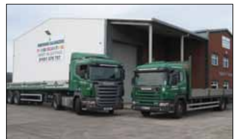
Aspect House, our new powder coating plant