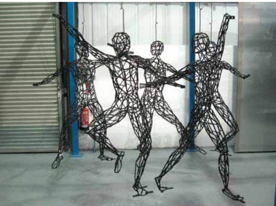
Still dancing in the powder coating plant

hear of instances where customers require a duplex coating and if problems occur the powder coater will blame the galvanizer and the galvanizer will blame the powder coater. Another concern of customers is where they have to spend hours fettling galvanized steelwork in preparation for taking it to their powder coaters. As we do both, we make these problems ours rather than our customers and hopefully they will see the time and cost benefits".